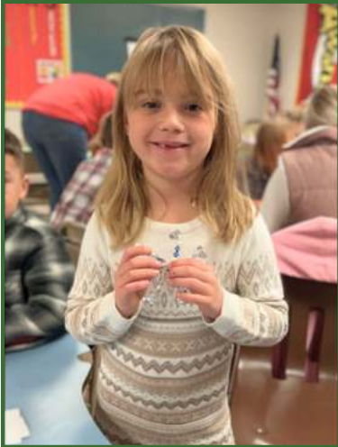
A Christmas ornament craft proudly displayed from Kindergarten through 2nd-grade Kids' Worship.