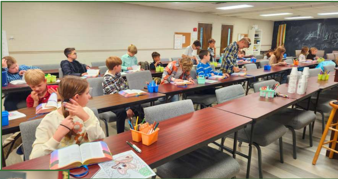
Look at all of those open Bibles in 3rd- through 6th-grade Kids' Worship!